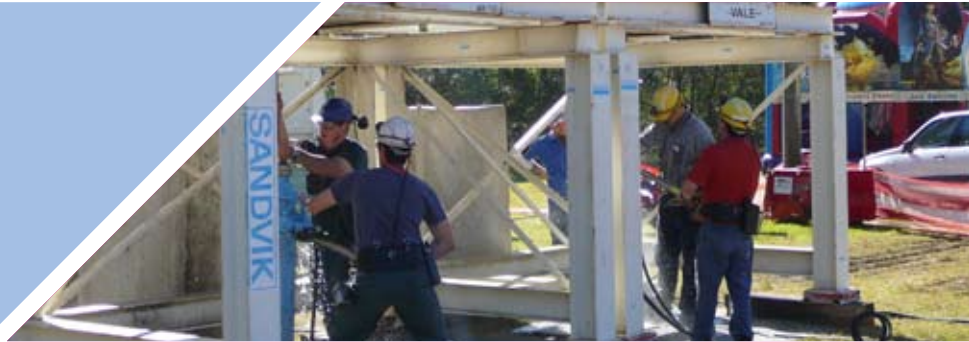
Above: The NSW Roof Bolting Championships were a crowd-pleaser at this year's festival.