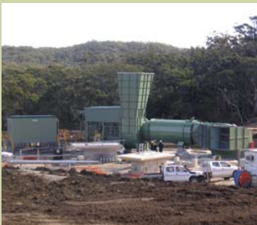
Above: Construction of one of three ventilation fans being installed on Shaft 3.

Chris joins the Dendrobium CCC with a key focus on the environment, and in particular, the protection and regeneration of local creeks and their associated flora and fauna.