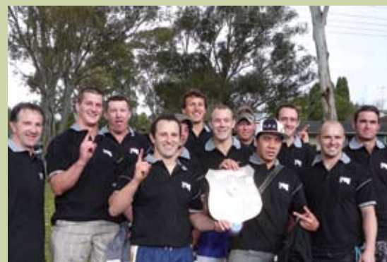
Below: The Mastermyne Cowboys (pictured), won the 2008 Cate Stevenson Coal Miners Shield in a close game against the Dendrobium Blues, 7-6.

All teams vowed to be back in 2009, faster and stronger, and ready to again raise much needed funds for charity.