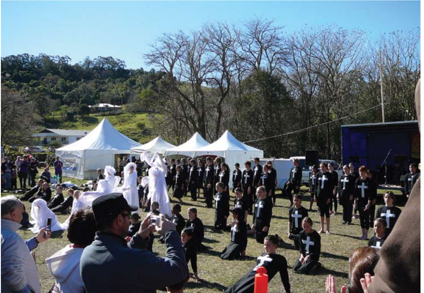
Above: Smith's Hill High School students recently performed their Rock Eisteddfod production, 96 Crosses, at the Mt Kembla Mining Heritage Festival

Mt Kembla's long mining history was brought to life recently through Smith's Hill High School's entry into the 2008 NSW Rock Eisteddfod Challenge.